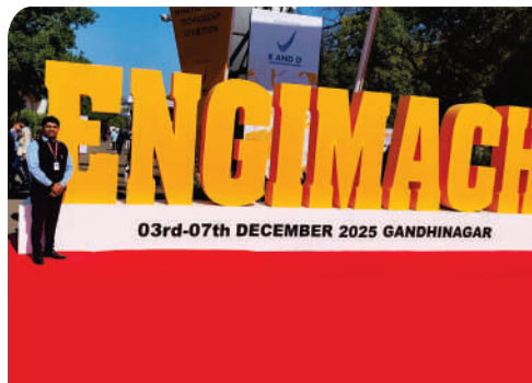
December 7, 2025: Our Procurement Member attended ENGIMACH 2025 at Gandhinagar, gaining insights into the latest automation and manufacturing technologies. ENGIMACH remains a key driver in the engineering machinery sector.