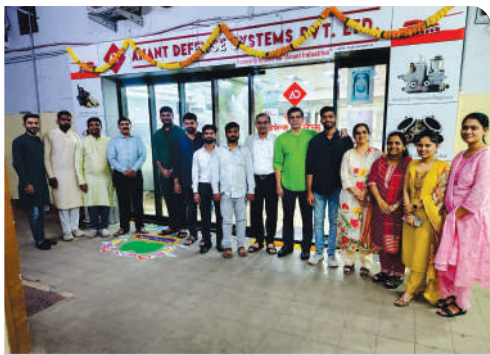
Khande Navami Puja at Head Office

On October 1, 2025 , the joyous festival of Khande Navami was celebrated with great enthusiasm across all departments. Machines on the shop floors were worshipped, sweets were shared, and heartfelt greetings spread among the entire Anant family.