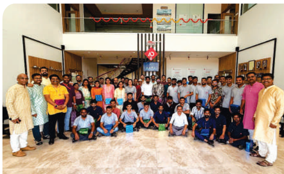
Diwali Celebration at Kesurdi Plant