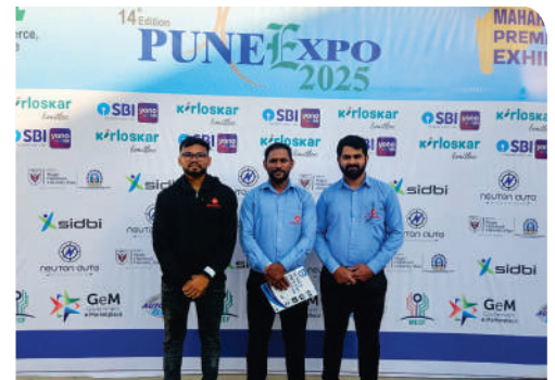
December 12, 2025: Our engineering team explored MCCIA Pune Expo 2025 , Maharashtra's top B2B exhibition, discovering the latest in automation, manufacturing, smart factories, IoT, and sustainable technologies.