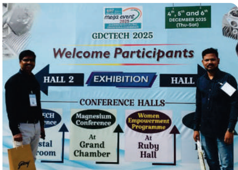
December 5, 2025: Our Associate Director, along with the engineering team, recently attended the GDC aTech Exhibition 2025 at Hotel Orchid, Pune. The event provided valuable insights into the latest advancements in Aluminum and Magnesium Die Casting, helping our team stay updated with cutting-edge technologies and industry trends.