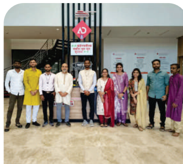
Team - QA