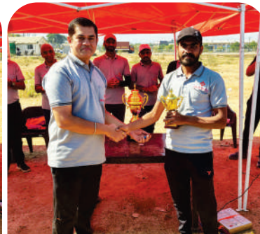
Arjun Award 2025