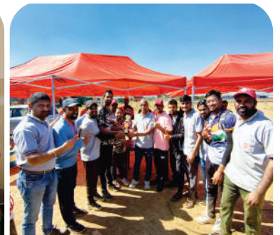
Volleyball Championship (Stores Team)