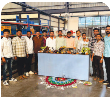
Team - Assembly