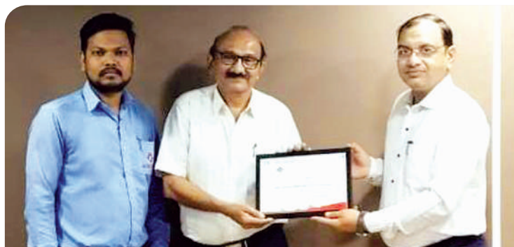
Best Heat Treatment Service Provider ThermoTechnics