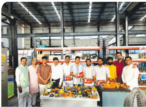
Team - Machine Shop