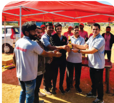
Fairplay Award 2025 (Machine Shop & Accounts Team)