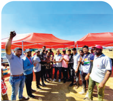
Cricket Winners 2025 (Stores Team)