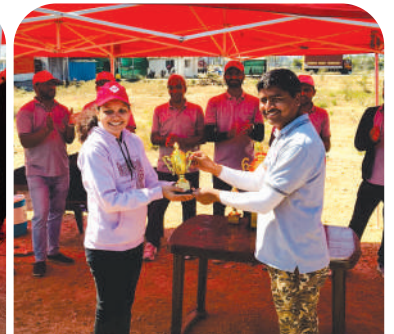
Rani Laxmibai Award 2025