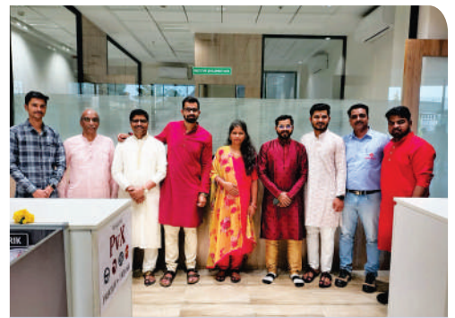
Team - PVX