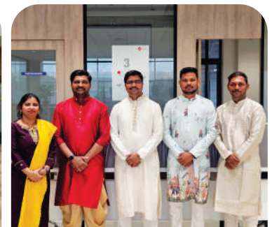
Team - Procurement