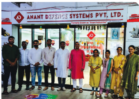
Diwali Celebration at Head Office

The festival of Diwali, symbolizing joy, light, and positivity, was celebrated with great enthusiasm by the Anant Family on October 18, 2025 . Employees exchanged sweets and gifts, while the entire workplace was adorned with vibrant flowers, colorful rangolis, and sparkling lanterns, creating a festive and cheerful atmosphere.