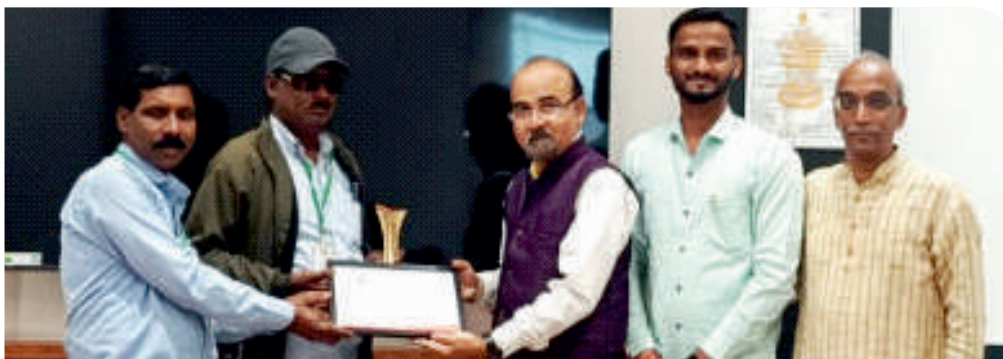
Best Material Testing Service agency Om MetaLab