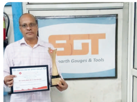
Best Gauge Manufacturing & Calibration Service Provider